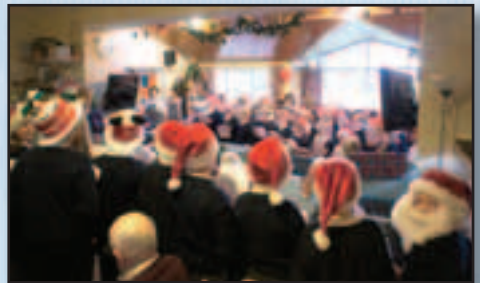
Billis Schoolchildren from Cavan

children enjoy all aspects of the day; We in Lodge Two have the easy part of only having to give small financial support to this very worthy cause.