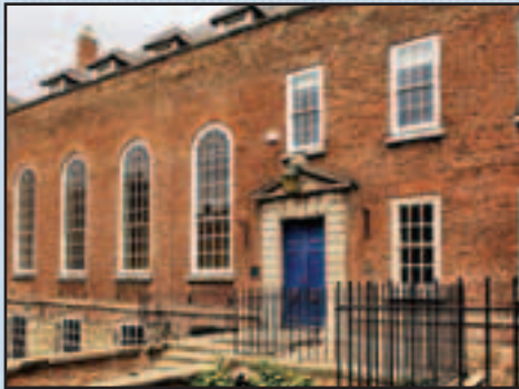
Front of Tailors Hall

On Saturday 19th May 2012 Freemasonry will revisit Dublin's historic Tailors Hall, the only surviving Guildhall in the city completed in 1706. This is where Grand Lodge regularly met from 1755 until 1818 on the first Thursday of every month. Indeed Freemason connections with the Tailor's Guild or "Fraternity of St John The Baptist of the Merchant Tailors of the City of Dublin" are probably older because in 1725 Grand Lodge retired to the Tailor's Church of St John The Evangelist, Fishamble Street, for a service of thanksgiving following the election of the first known Grand Master.